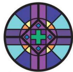
Christ Church Annual Meeting 2015