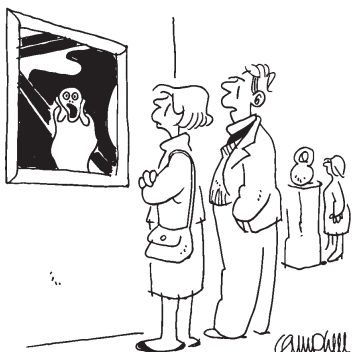
"It's titled 'Call for Volunteers.'"

Answer: When I am in distress, I call to you, because you answer me. Psalm 86:7, NIV