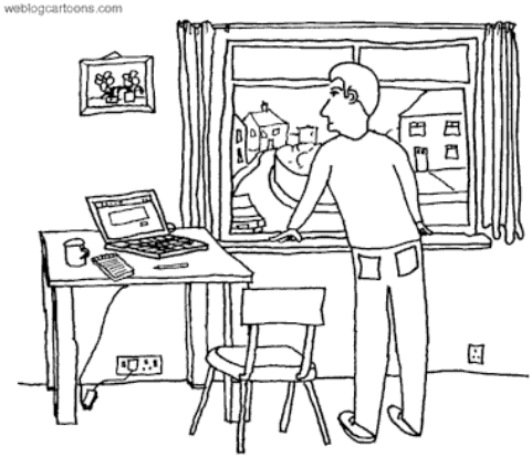
I AM LOOKING OUT OF THE WINDOW WAITING FOR SOMETHING TO BLOG